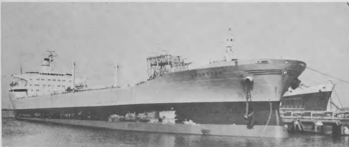
The Norwegian tanker Thorstar visiting Lago last month, was the largest tanker in tonnage to call at San Nicolas harbor. With a capacity of 74,883 dwt., she is 800 ft. long and 121.02 ft. wide.

E tankero Noruego Thorstar cu a bishita Lago luna pasa, tabata e tankero mas grandi den tonelada cu a bishita Haf di San Nicolas. El tin un capacidad di 74,883 ton, un largura di 800 pia y hanchura di 121.02 pia.